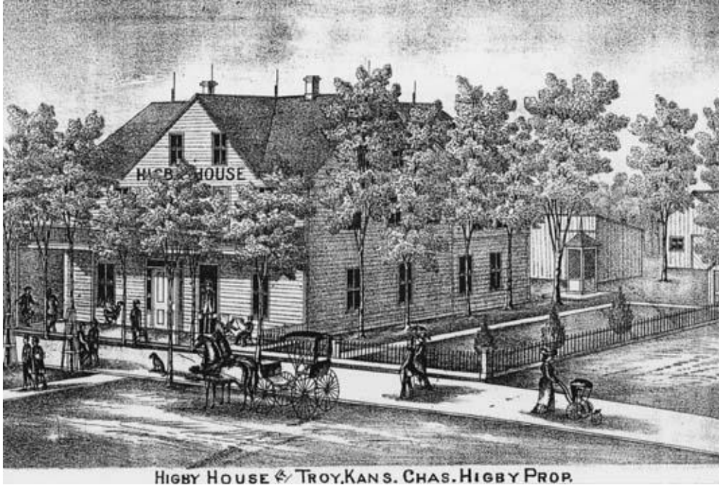
Doniphan County, Kansas 1882 Plat Book

written by authors working for the Federal Writer's Project, Viking Press, New York, 1939. However, other sources have also been used, the content combined, and heavy editing has occurred, resulting in much change from the original.