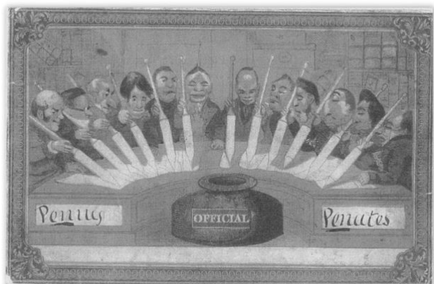
The first known postcard. 1840

The initial views on deltiology were somewhat different from the ones we have today. At the beginning of the 20th century, it was believed that only a postcard that had been mailed, and thus "fulfilled its function", could be a worthy collectible. Moreover, many collectors would only be interested in a postcard with a view of a city or locality if it had been mailed from that city or locality. A blank postcard without a postmark was equated to a simple "picture". Today, however, some collectors actually ignore cards with writing on them. Postcards are usually valued in proportion to their age and rarity of their subject.